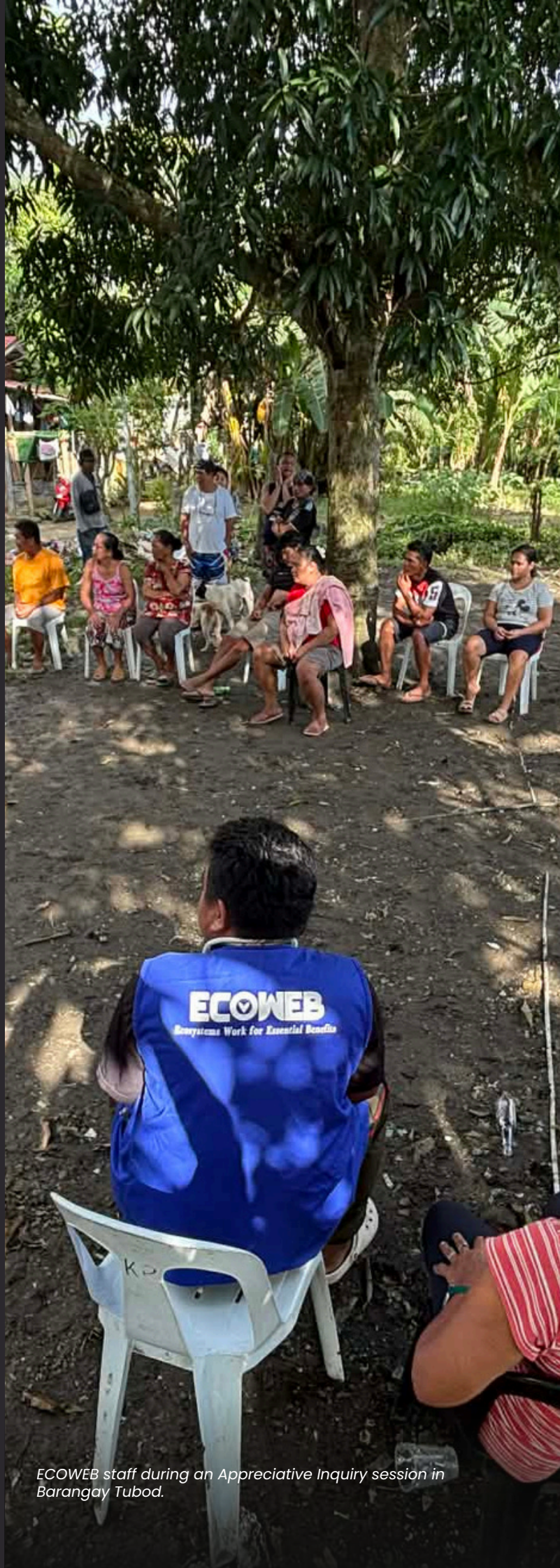
ECOWEB staff during an Appreciative Inquiry session in Barangay Tubod.