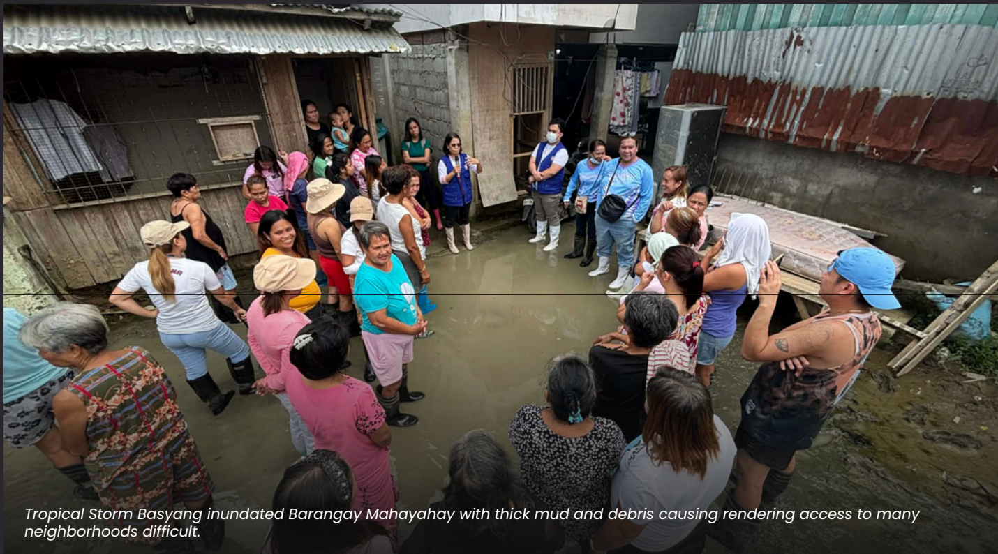
Tropical Storm Basyang inundated Barangay Mahayahay with thick mud and debris causing rendering access to many neighborhoods difficult.