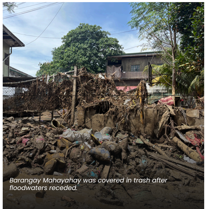
Barangay Mahayahay was covered in trash after floodwaters receded.