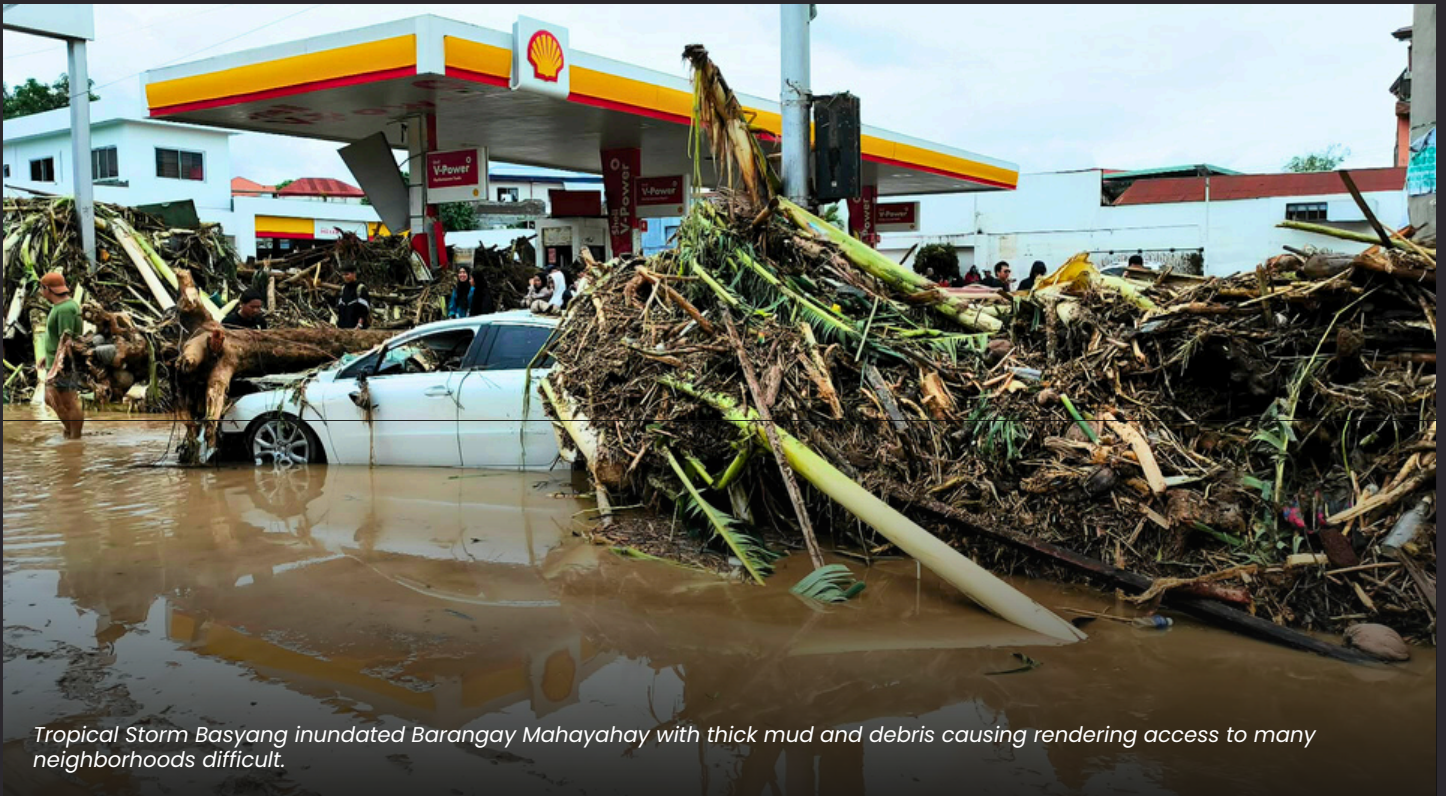
Tropical Storm Basyang inundated Barangay Mahayahay with thick mud and debris causing rendering access to many neighborhoods difficult.