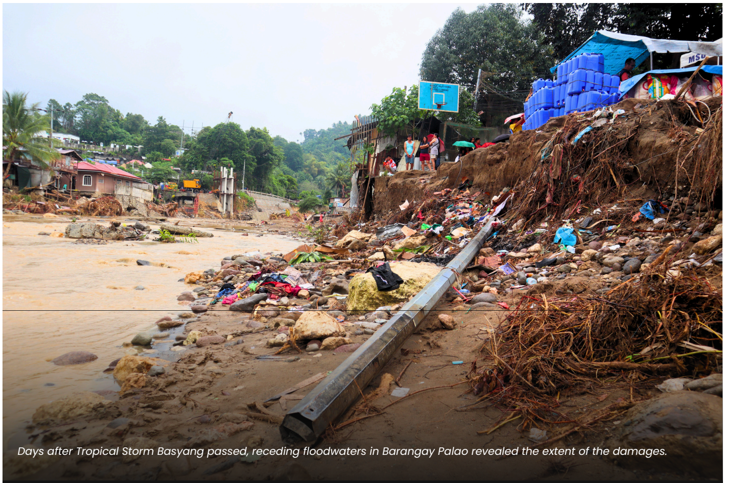
Days after Tropical Storm Basyang passed, receding floodwaters in Barangay Palao revealed the extent of the damages.