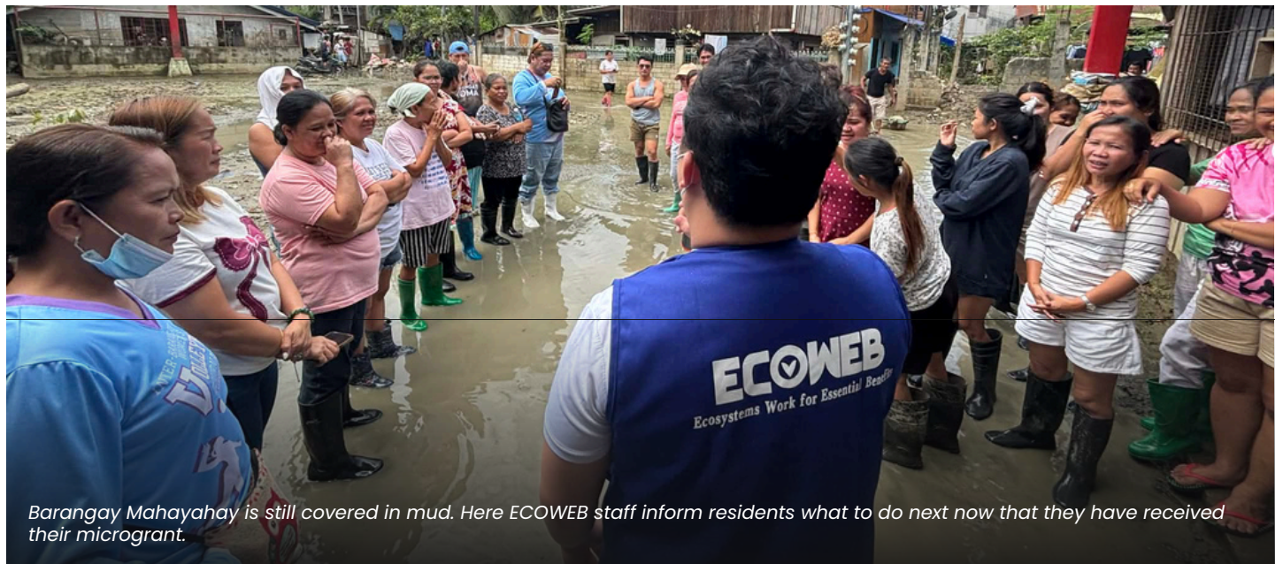
Barangay Mahayahay is still covered in mud. Here ECOWEB staff inform residents what to do next now that they have received their microgrant.