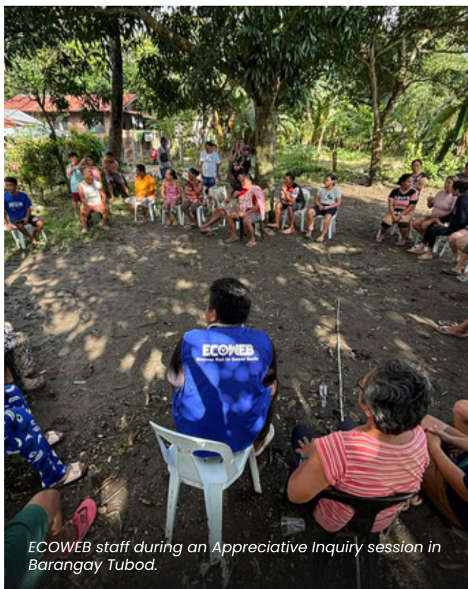
ECOWEB staff during an Appreciative Inquiry session in Barangay Tubod.