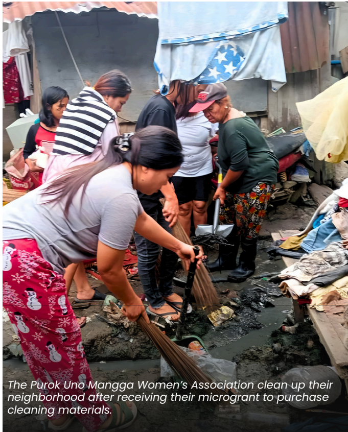
The Purok Uno Mangga Women's Association clean up their neighborhood after receiving their microgrant to purchase cleaning materials.

The micro-grants enabled community organizations—particularly women’s groups and local associations—to implement immediate actions addressing urgent post-flood needs. These initiatives focused on debris and mud clearing, drainage restoration, household clean-up, provision of basic items, and early livelihood and dignity support , allowing communities themselves to lead the recovery of their neighborhoods.