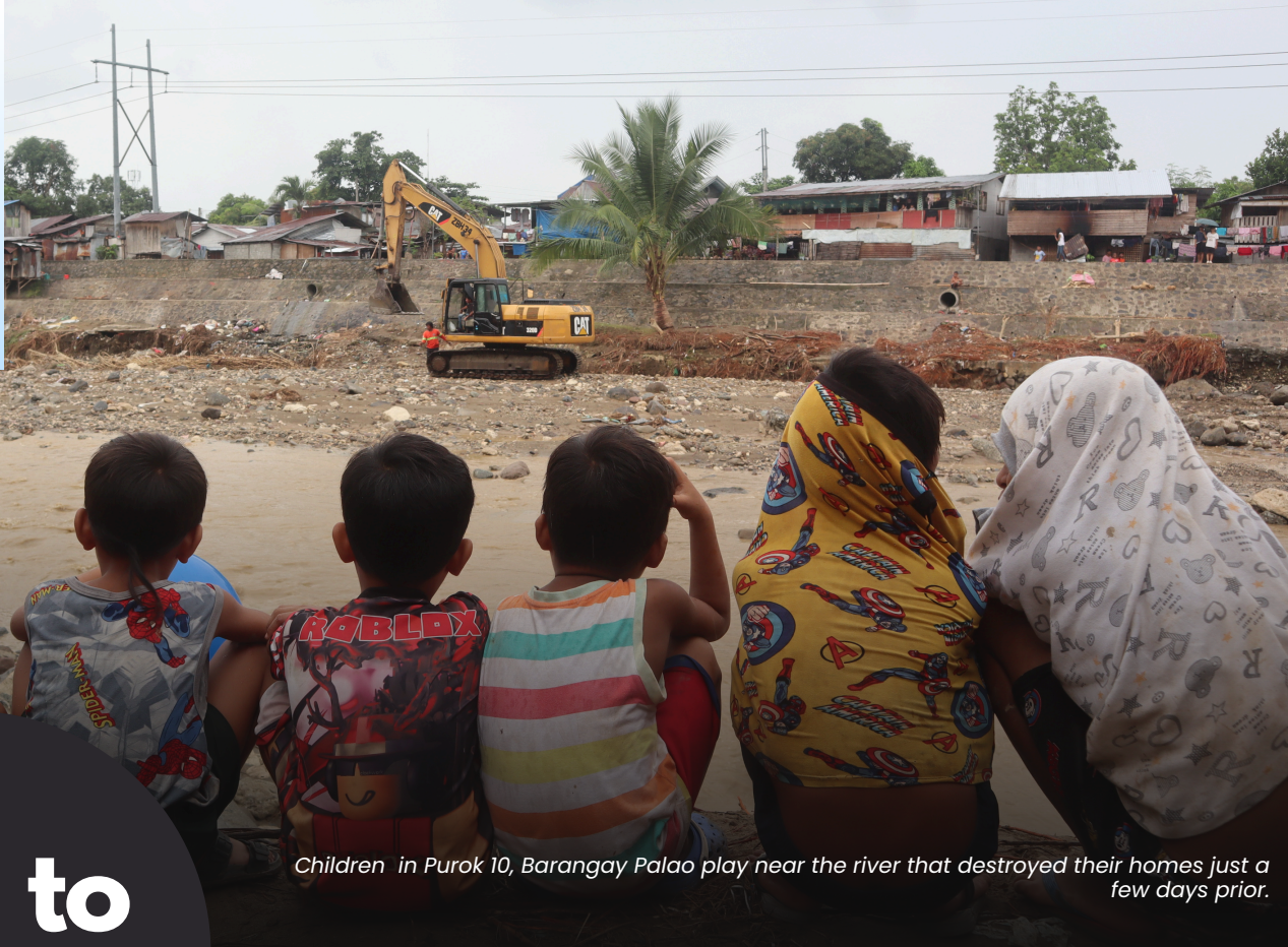
Children in Purok 10, Barangay Palao play near the river that destroyed their homes just a few days prior.