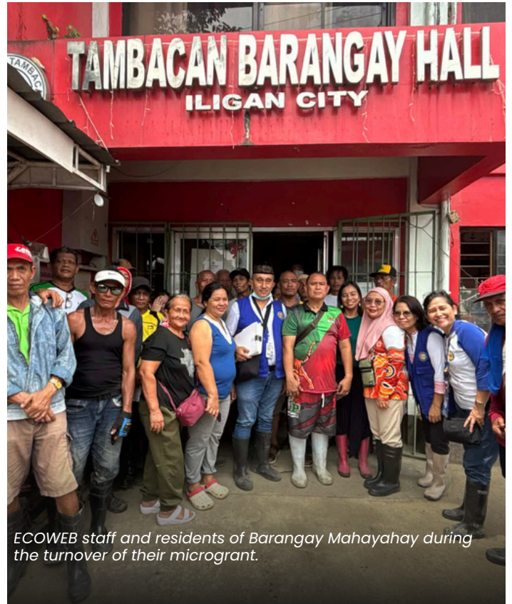
ECOWEB staff and residents of Barangay Mahayahay during the turnover of their microgrant.