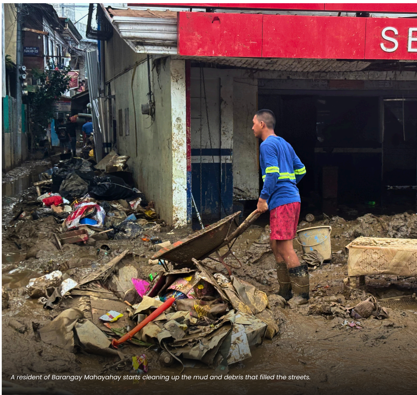
A resident of Barangay Mahayahay starts cleaning up the mud and debris that filled the streets.

The coordination efforts led by the local government unit of Iligan through its ICDRRM Office, concerned departments and agencies, is aimed to effectively bring the needed relief assistance of the affected communities while already starting the planning process for recovery and rehabilitation. The Iligan City People's Council (ICPC), where ECOWEB is a member, also partners with the Iligan LGU in facilitating humanitarian actions to ensure that the unreached, especially those home-based are reached by the relief operation of the government. This is apart from the initiatives of the ICPC members and other private sector groups to directly provide assistance to the affected communities receiving less support and attention from the government and complementing support for other unmet needs of the affected.