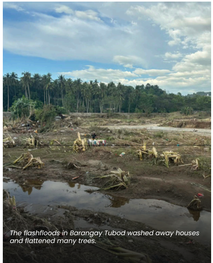
The flashfloods in Barangay Tubod washed away houses and flattened many trees.