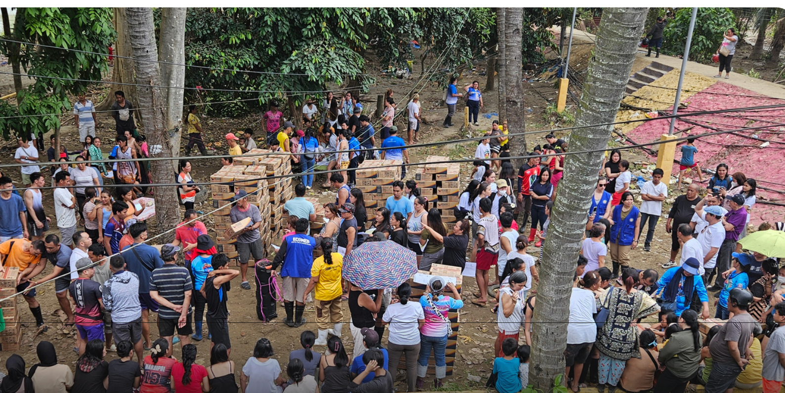
ECOWEB staff and volunteers, ICPC members and volunteers, and LGU representatives during the distribution of relief assistance to residents of Barangay Tambacan.